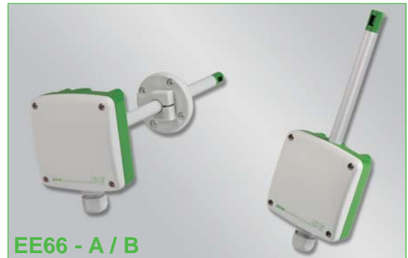
EE66 - A / B

An integrated LC display and a version with remote sensing probe are also available.