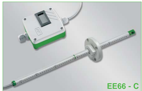
EE66 - C